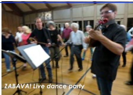
ZABAVA! Live dance party

Strawberry Recreation Center 118 E. Strawberry Drive Mill Valley Exit Hwy.101 at Tiburon Blvd. (131). Go east towards Tiburon for 3/4 mile to E. Strawberry Drive. Turn right , then go straight to the parking lot entry on right.