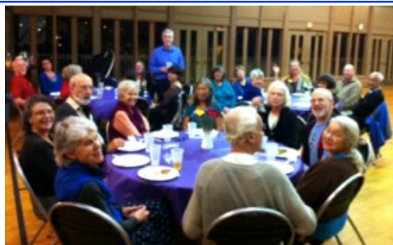
Pot Luck December 5 th at Strawberry Rec. Center