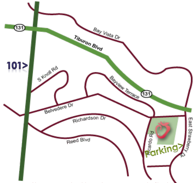
(See map to Strawberry on website.)

LIVE at Kopachka! Friday, OCTOBER 21, 2016 8-11pm $15 Bulgarian Folk Dance Party